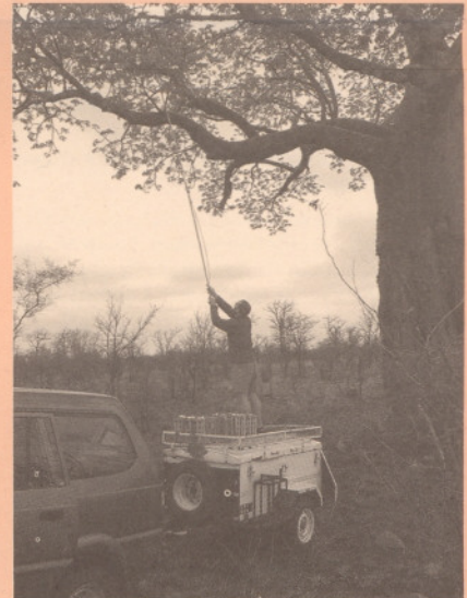
Often samples of plant material need to be taken as the fauna and flora unfolds and rarely in a predetermined manner, such as this Boabab Tree ( Adansonia digitata ) sample being collected by Olivier Maurin.