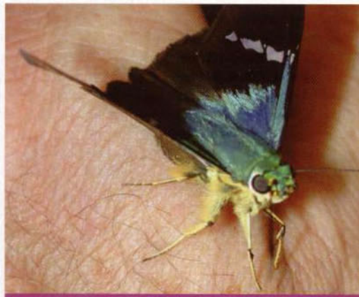
FLUTTERING FACSIMILE — Scientists using DNA bar coding found that this skipper butterfly, currently called Astrartes fulgerator , belongs to one of at least 10 species that hadn't been previously distinguished.